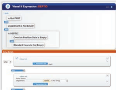
...rule-based form logic...