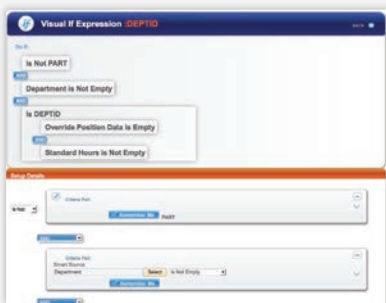
...rule-based form logic...