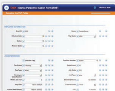
Configuration-based page design...